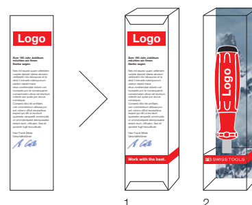
Representation of the gift packaging with an individually designed greeting. View of rear side (1) and front side (2).

Thanks to the high-quality transparent box, your imprinted company logo on the tool and on the card is immediately visible. Operating instructions are included in each packaging.