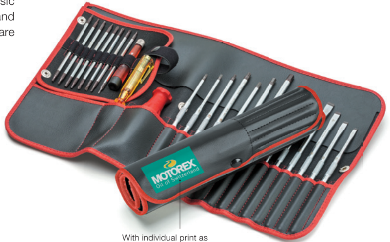
With individual print as an ideal gift.